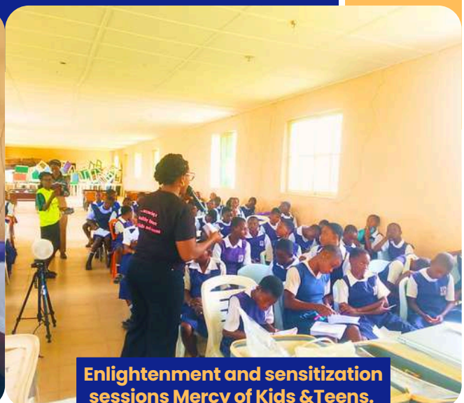
Enlightenment and sensitization sessions Mercy of Kids & Teens.