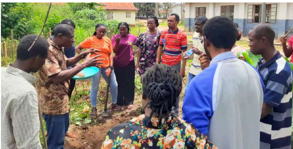
Vocational instructors receiving lecture at the MSTP Farm during GNAT Session.