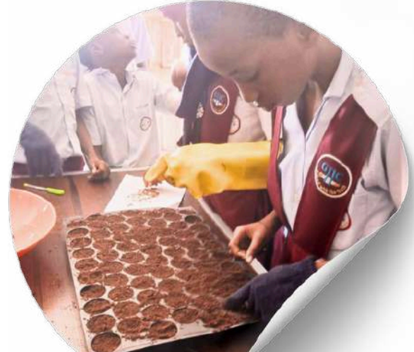
GNAT Class: Students of Greater Tomorrow International School filling the Tomato Nursery tray.