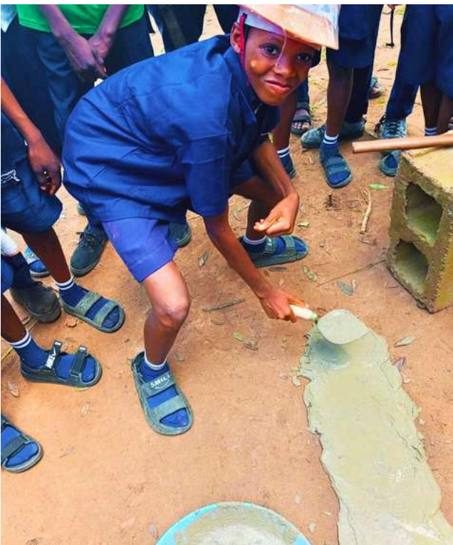
WET-Workshop and Engineering Techniques class at Imade College, Owo: Bricklaying in action.