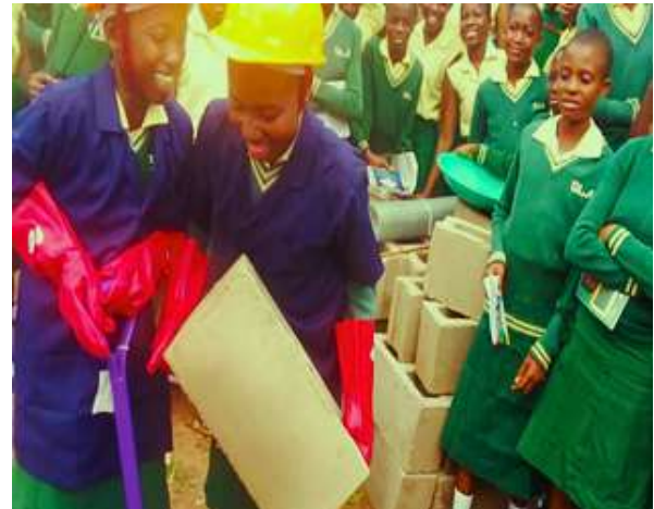
WET: St Louis Girls in a bricklaying session