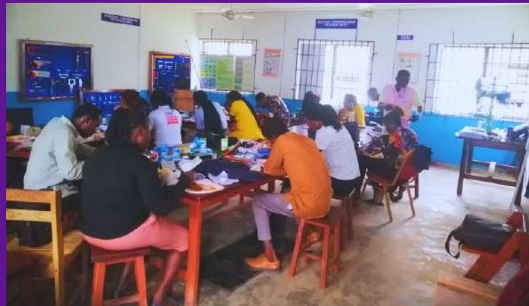
Vocational instructors having launch.