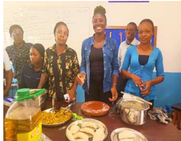
Instructors displaying culinary arts during an FPT practical session.