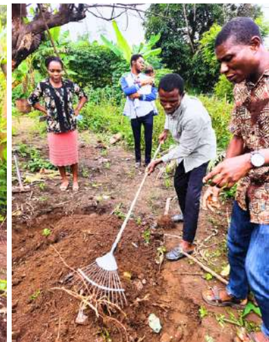
Vocational instructors clearing and cultivating MSTP Farmland during GNAT Session.