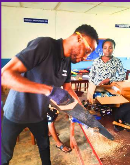
Vocational instructor cutting wood during the WET Session.