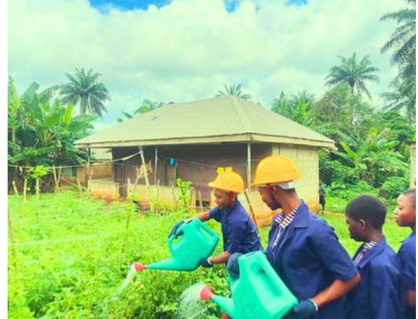
GNAT- Gardening Nursery and Agric Techniques Session at Springtide Secondary School, Igbatoro.