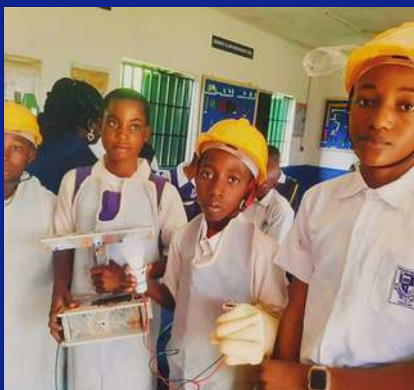
Students of Anglican Grammar School Igbara-Oke displaying the DC electricity box they produced at the EE-Energy & Environment class..

The second year of the MSTP Africa project in Ondo State started with great optimism. We are delighted to report that the first term commenced on a positive note in all the 9 pilot schools.