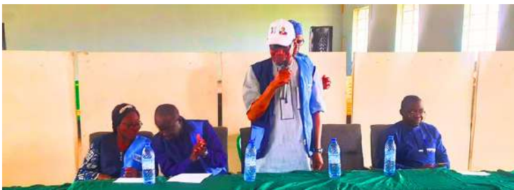
Commissioner's Speech at the ToT Closing Ceremony