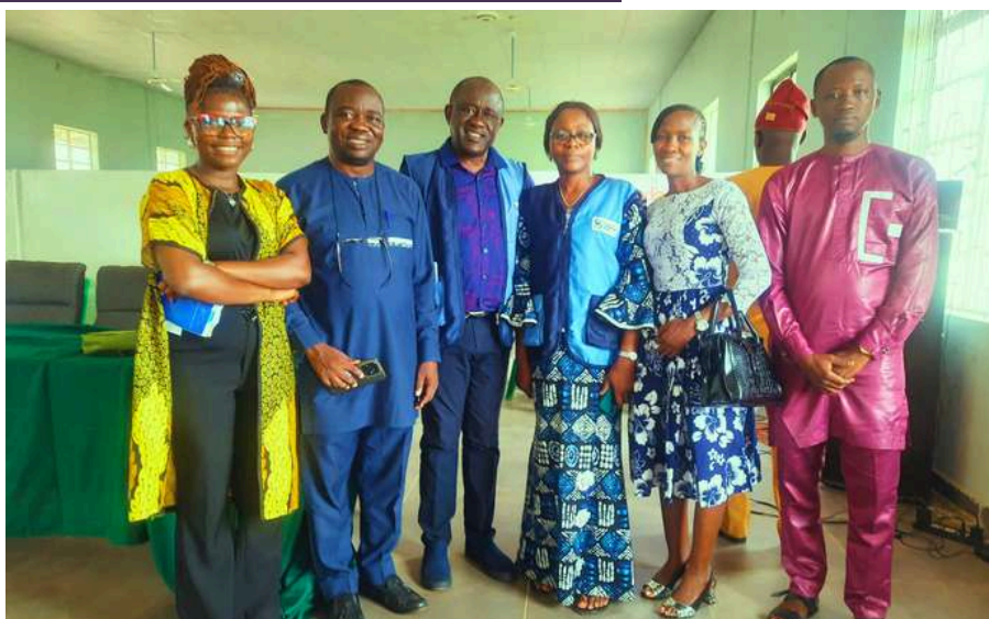
Photography Session at the end of the ToT closing ceremony.