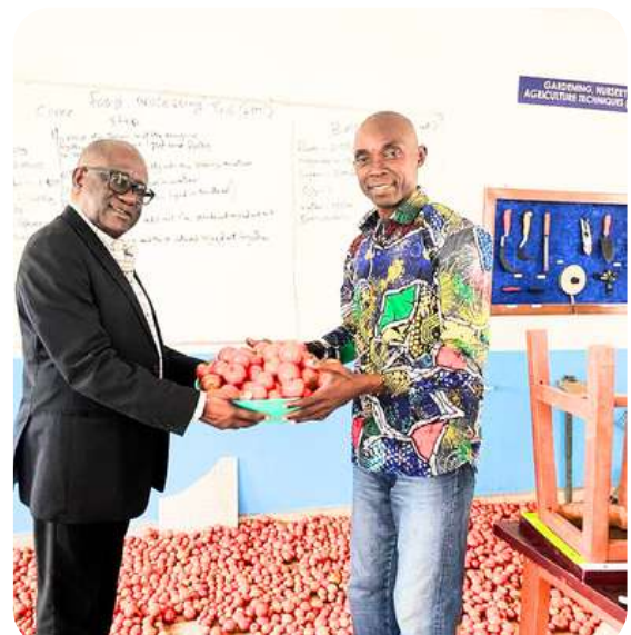
Presentation of Tomatoes harvested at St Louis Girls Grammar School to the MSTP CEO by the Lead Instructor