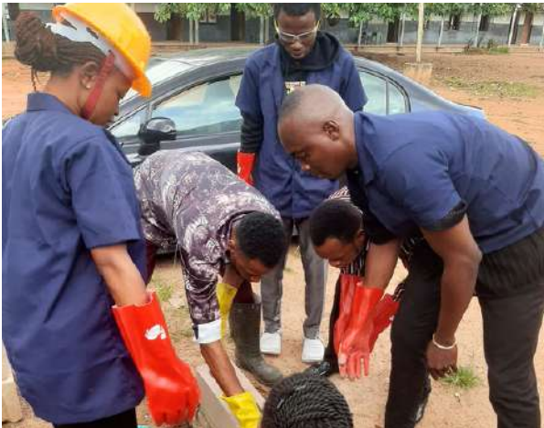
WET: Bricklaying Training Class.