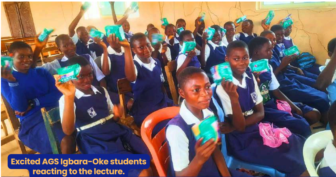
Excited AGS Igbara-Oke students reacting to the lecture.