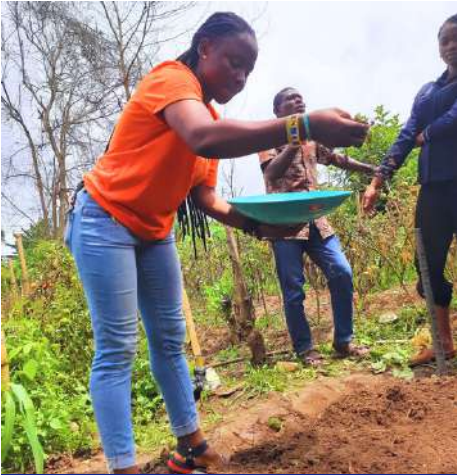
Vocational instructors planting seeds at the MSTP Farm.