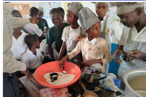
Students of Manuwa in a Food Processing Techniques (FPT) Class.