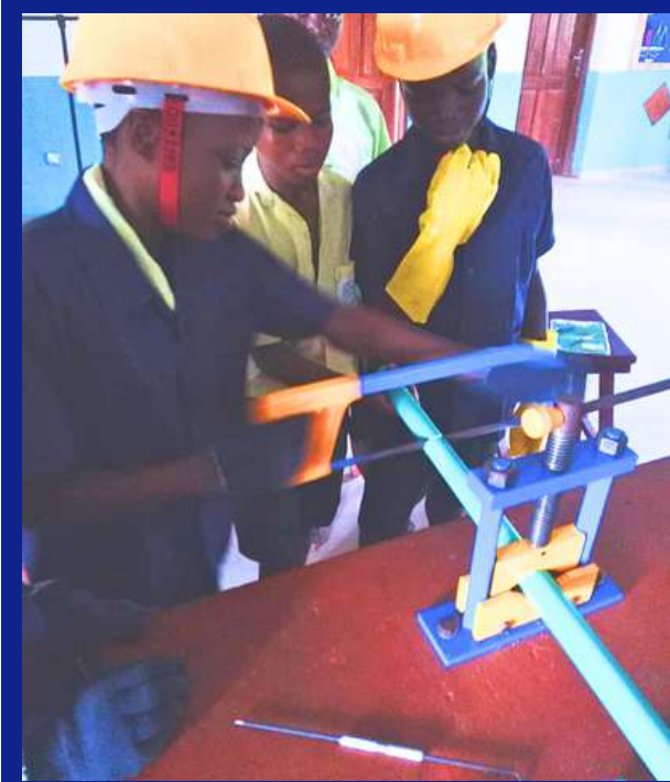
WET-Workshop and Engineering Techniques class at Oyenusi Grammar School.