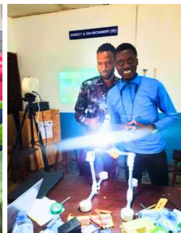
Energy & Environment Session