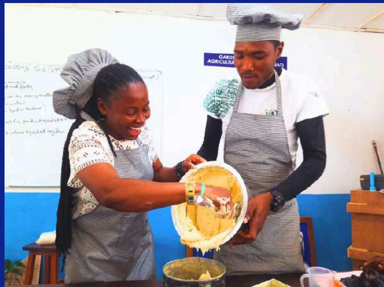
Vocational instructors mixing the recipe for cake during FPT session.