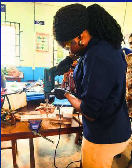
Vocational instructor drilling a hole during the WET Session.