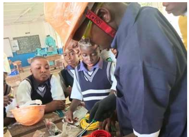
EE-Energy & Environment Class at Owo,