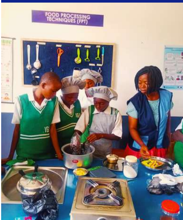
Students hands on practical Independence Grammar School, FPT. Ondo, Ondo State, Nigeria.