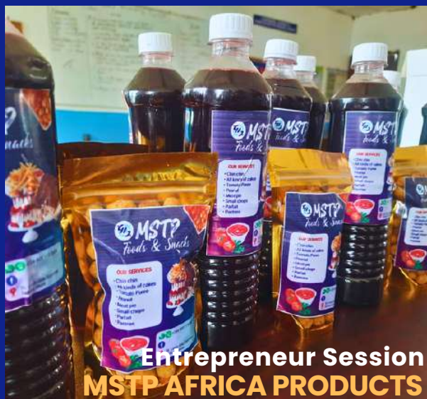
Entrepreneur Session MSTP AFRICA PRODUCTS