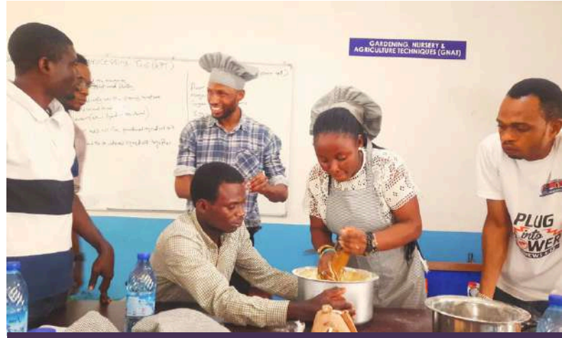
Vocational instructors mixing the recipe for cake during FPT session.