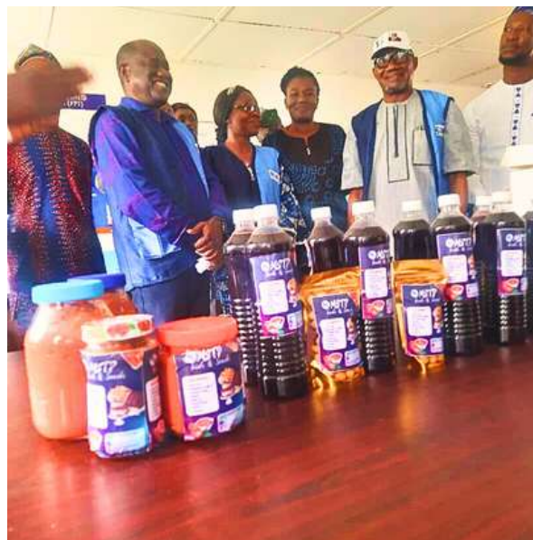
MSTP CEO Marketing the MSTP products to the Commissioner